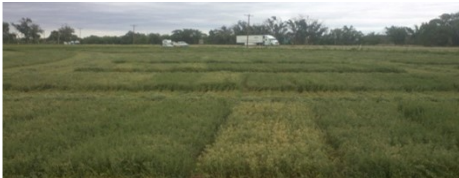
Alfalfa variety performance evaluation

Artesia Agricultural Science Center, Farmington Agricultural Science Center, Leyendecker Plant Science Center, and Los Lunas Agricultural Science Center