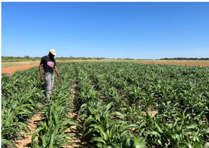
Biochar experiment conducted at Tucumcari during 2023.