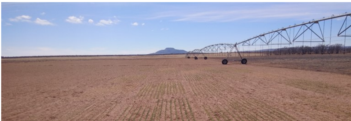
Winter cereal forages for control of field bindweed. The cereals have been heavily grazed by wildlife and the bindweed is dormant (2-15-2024).

Field bindweed is a perennial weed with an extensive root system that significantly reduces crop productivity when it gains a competitive advantage. Tillage is known to reduce bindweed competition, but conversion to no-tillage practices in semiarid regions is encouraged. Using winter cereal cover crops planted in early autumn when the bindweed is dormant or growth is reduced may interfere with spring growth by bindweed limiting its competition with summer crops and allowing for forage harvest of both winter and summer crops. Sorghums are known to exhibit allelopathy against other plants and compete by shading as a taller-growing species. No-tilling sorghum-sudangrass soon after winter cereal harvest may allow the sorghum forage to gain a competitive advantage over the bindweed and continue competition by shading until harvest. This double cropping sequence could continue, potentially depleting the established bindweed and preventing new seedlings from becoming established.