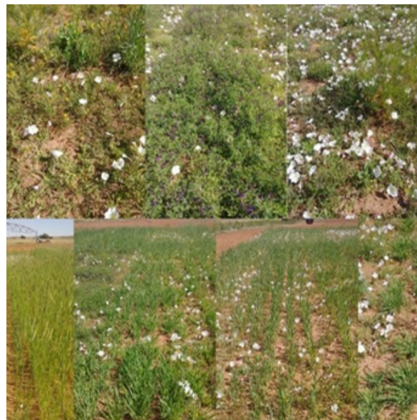
Cover crop species planted as monocultures at Tucumcari 2022. Top row, l-r: Austrian winter pea, hairy vetch, and unplanted control Bottom Row, l-r: Cereal rye, barley, triticale, oat

New Mexico Department of Agriculture Healthy Soil Program