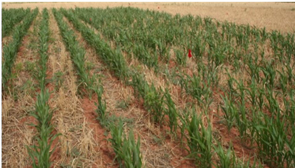
Grain sorghum in one-time application of manure in strip-till zone at Tucumcari in 2023.

By applying manure to only the strip-till area, manure application costs can be cut by up to 60%. Additionally, the research showed single 10 tons /acre manure application with 6-inch incorporation resulted in an increase in grain sorghum biomass yields and water use efficiency by 22% and 7%, respectively, compared to the no manure control eight years after the initial manure application. This demonstrates the long-term benefit of a one-time manure application in a strip-till zone. This research provides sustainable management solutions for water conservation and environmental stewardship in New Mexico. New Mexico's dryland producers can benefit significantly from this research by cutting the cost of production and improving water use efficiency.